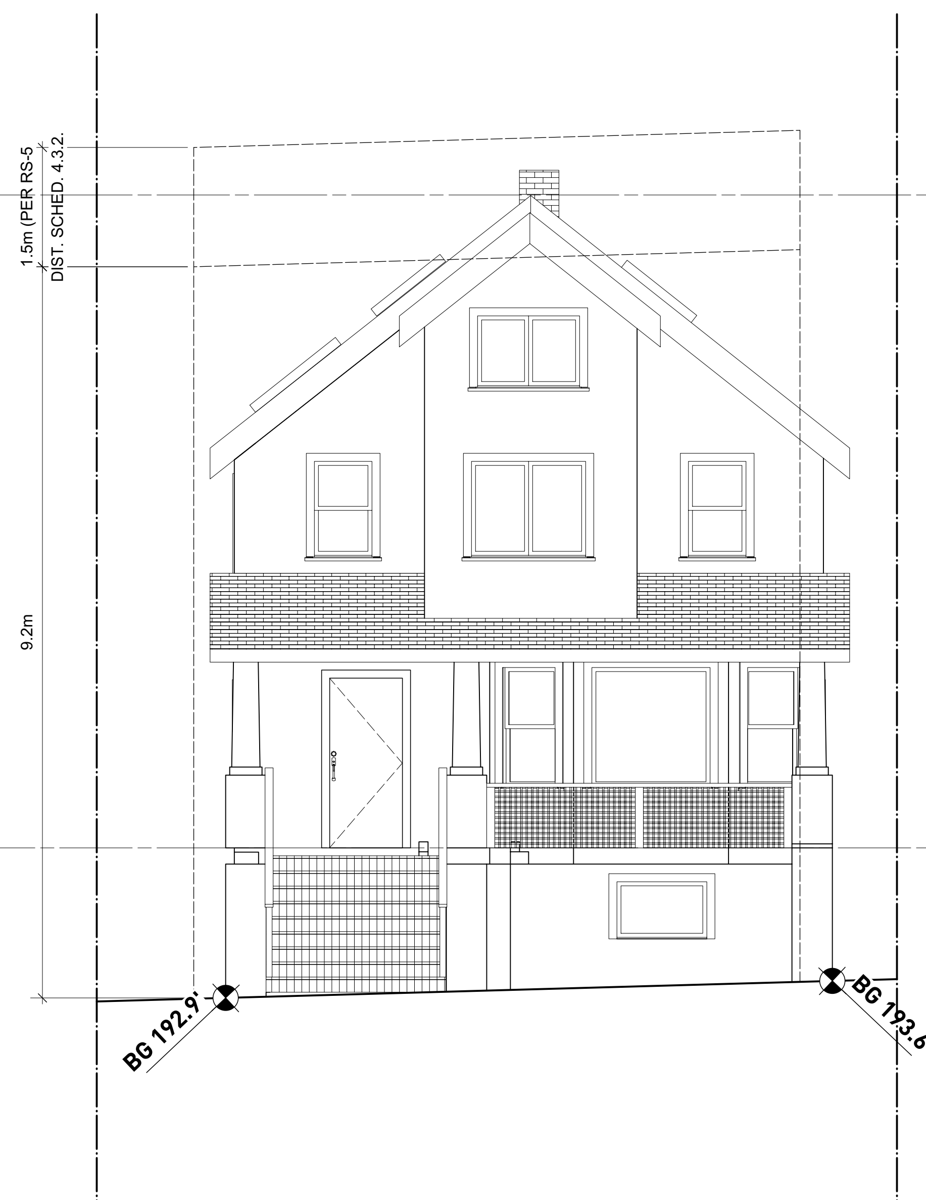
1 SOUTH ELEVATION