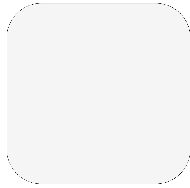
01 ■ HARDIE 2.0 FIELD PAINTED White

Prior to commencement of the Work, the Contractor shall review and verify drawing dimensions, datums and levels to identify all discrepancies between information on this drawing and 1) actual site conditions, and; 2) the remaining Contract Documents. The Contractor shall bring these items to the attention of the Architect for clarification before proceeding with work.