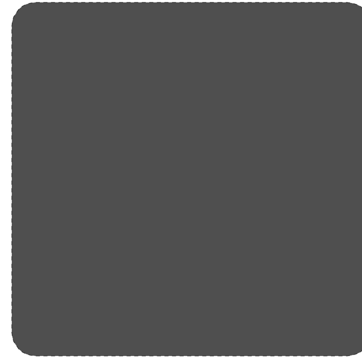
06 ■ POWDER COATED ALUMINUM SUNSCREEN Dark Charcoal Gray