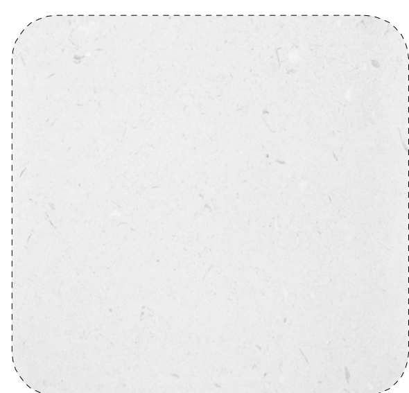
04 ■ CONCRETE Sandblasted / Sealed