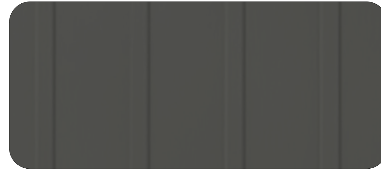
05 ■ STANDING SEAM METAL ROOFING Dark Charcoal w/ matching painted flashings