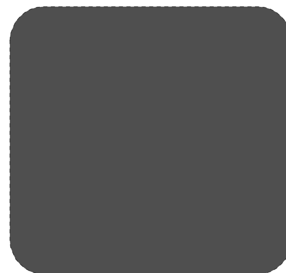
08 ■ CHARCOAL GREY Metal Doors & Metal Grids (Parkade Access)