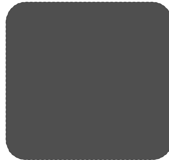
07 ■ CHARCOAL GREY Window Frames / Service Doors / Flashings / Trims