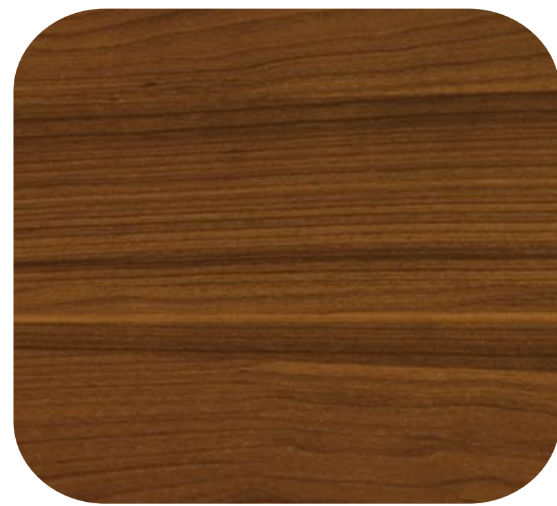
02 ■ LONGBOARD SIDING Dark National Walnut