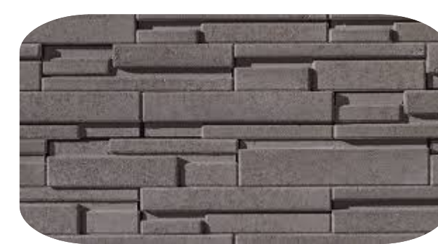
09 ■ PERMACON SKYLINE WALL BLOCK Dark Gray