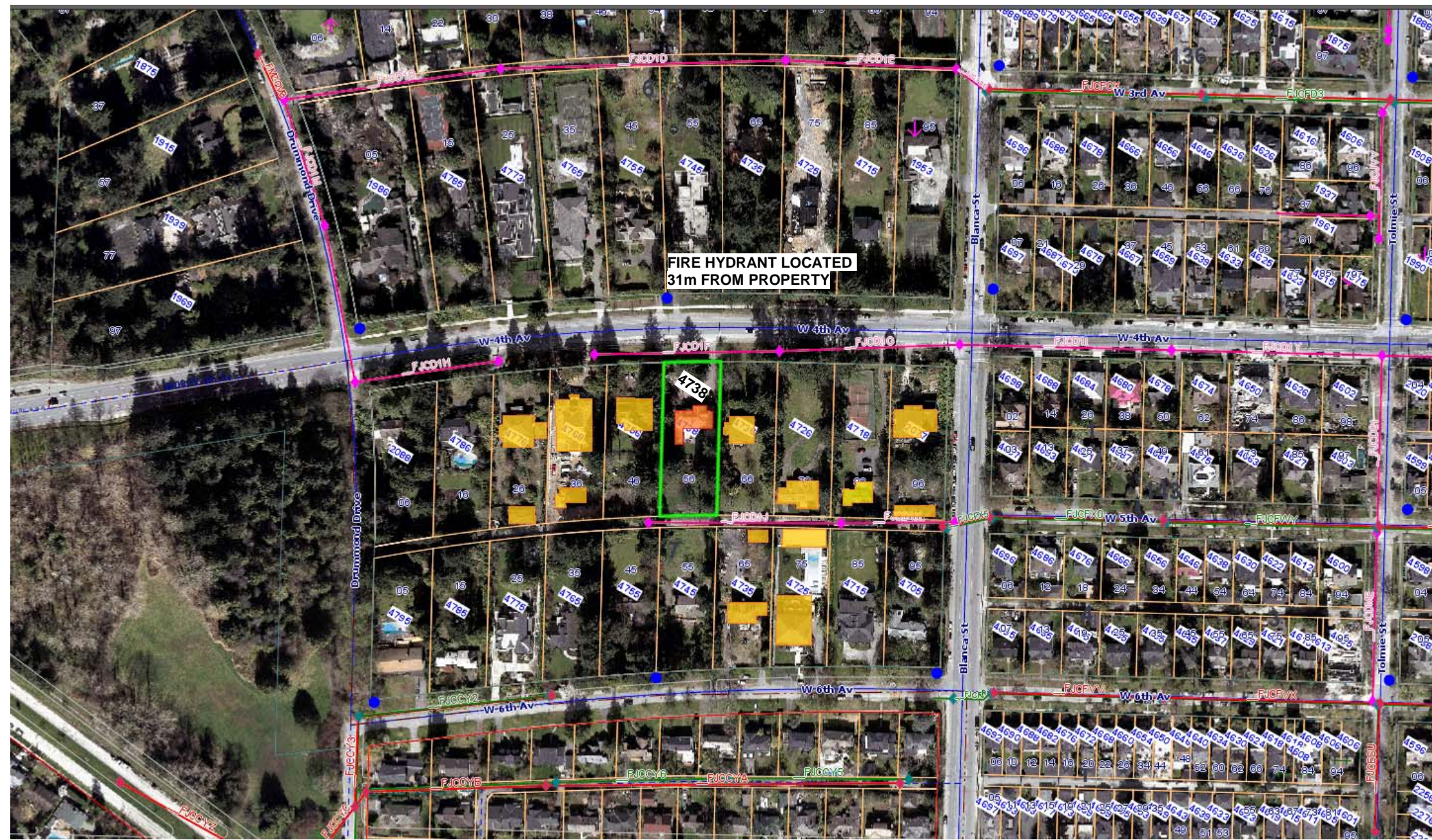
CONTEXT PLAN SCALE - N.T.S