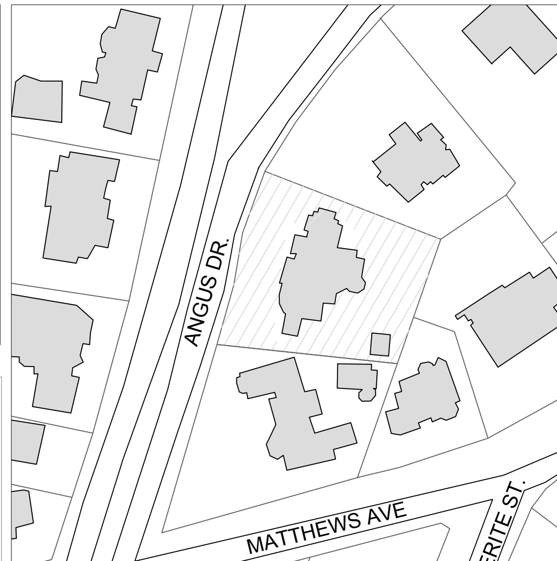
KEY MAP - NOT TO SCALE