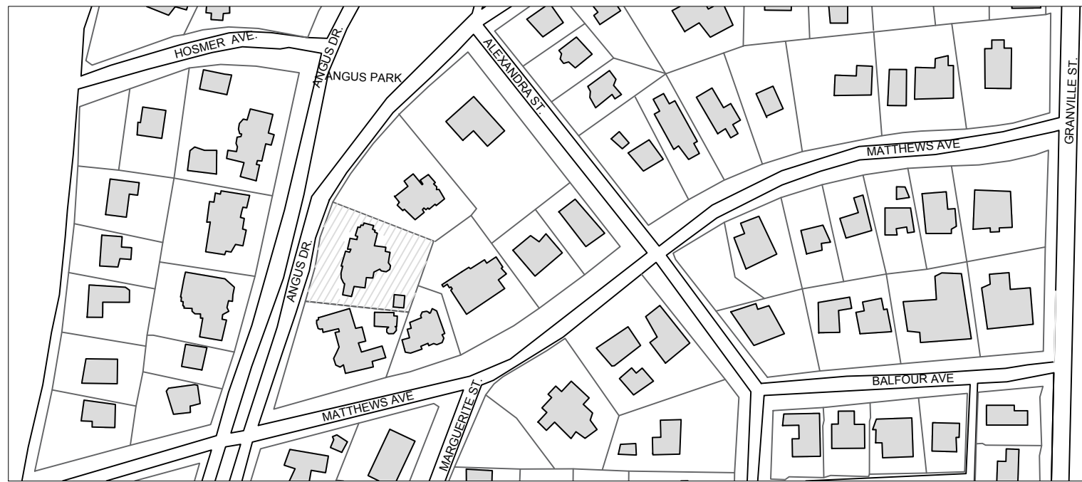
KEY MAP - NOT TO SCALE