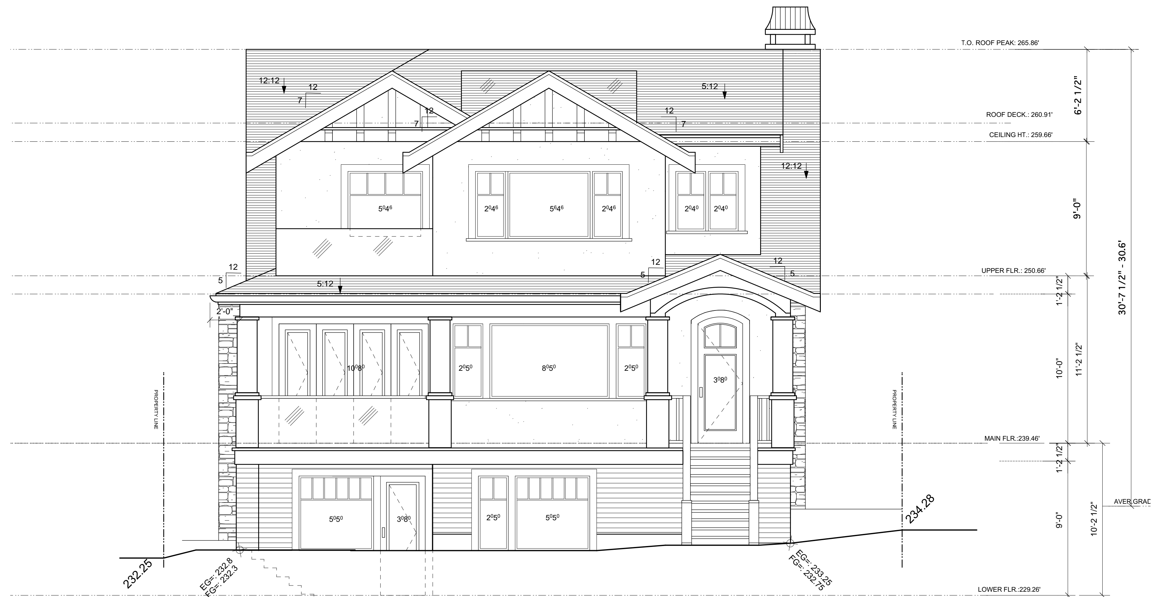
NORTH ELEVATION Scale: 1/4" = 1'-0"