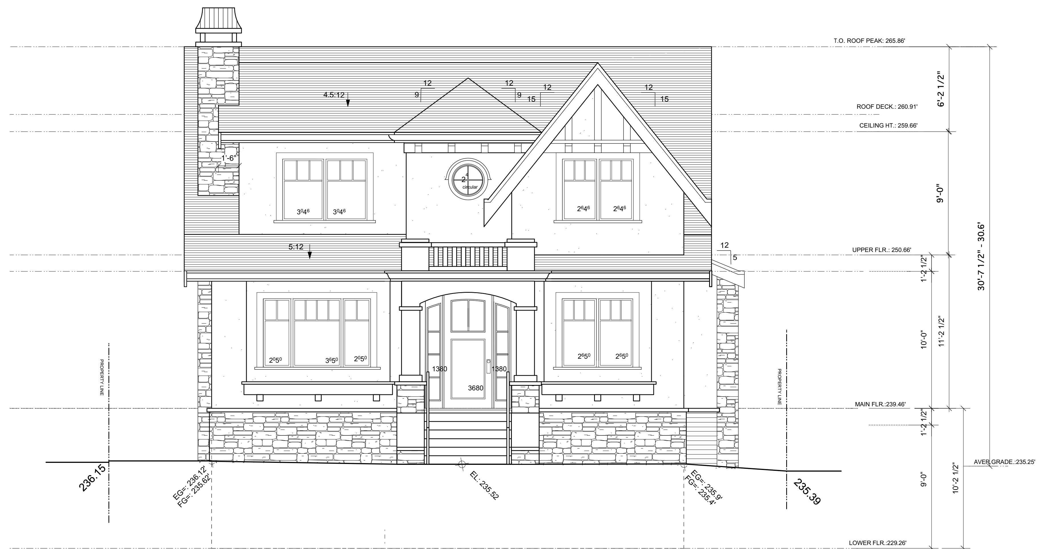
SOUTH ELEVATION Scale: 1/8" = 1'-0"