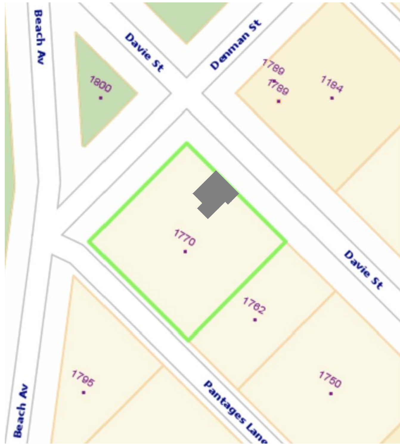
1 LAND PARCELS ID 2 SCALE: NTS