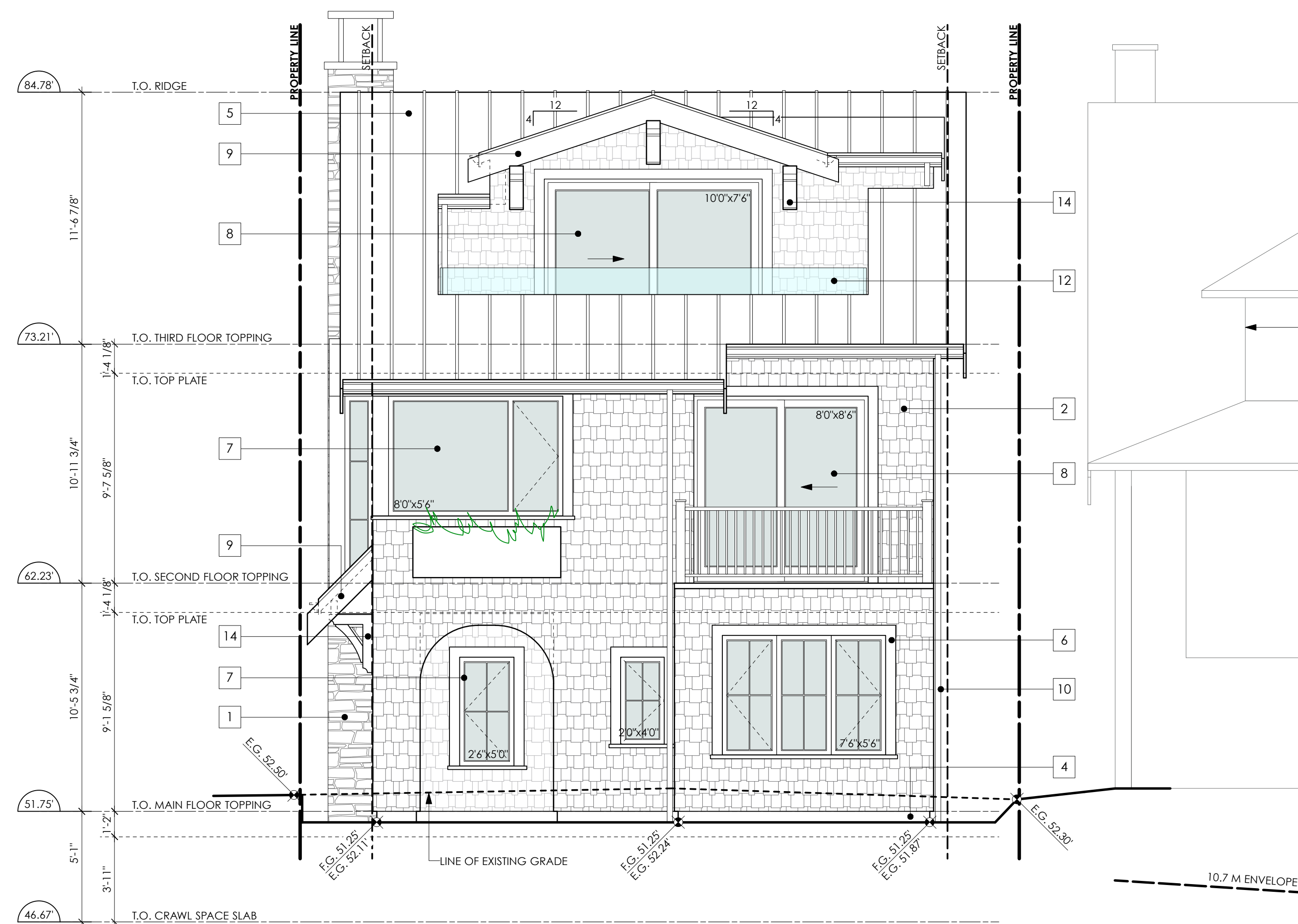
SOUTH (REAR) ELEVATION