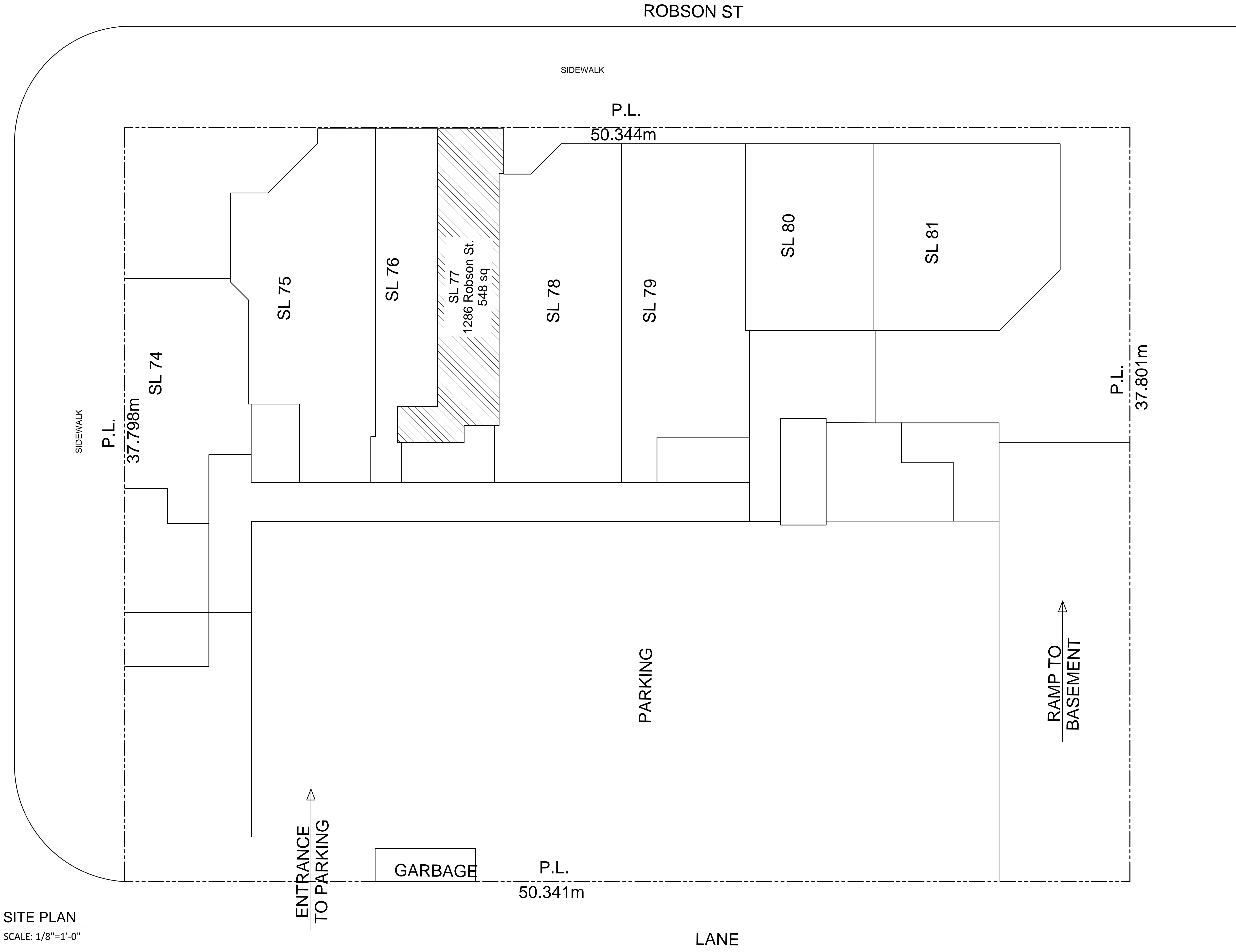
SITE PLAN SCALE: 1/8"=1'-0"

DRAWN BY: CN SCALE: 1/8" DATE: Feb, 2016 DRAWING NUMBER: A 1 OF 1