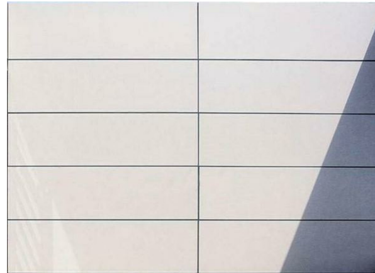
Fibre cement panels with reveals on Infill Buildings