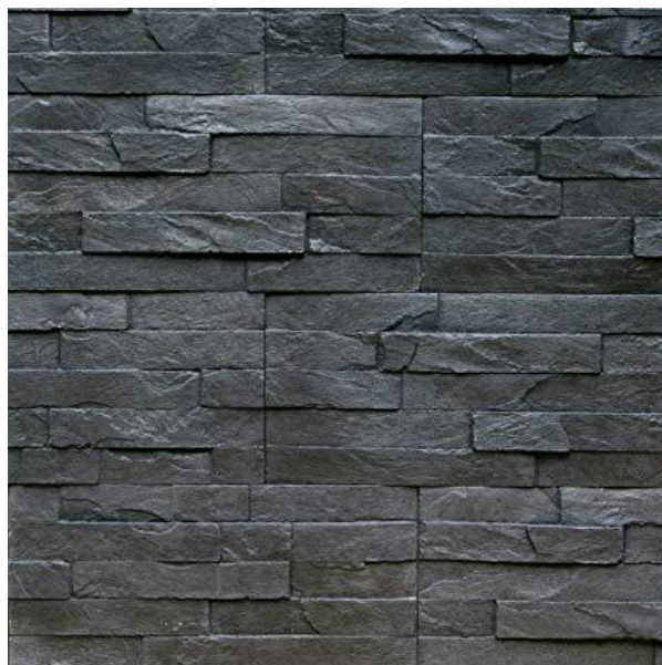
Concrete Veneer on Heritage Building