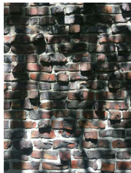
Existing Brick Chimney on Heritage Building