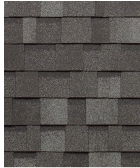
Asphalt Shingles on Heritage Building Roof