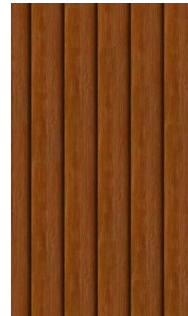
Metal siding with cedar effect on Infill Buildings