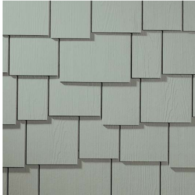
Hardie Fibre Cement Shingles - Light Mist on Heritage Building