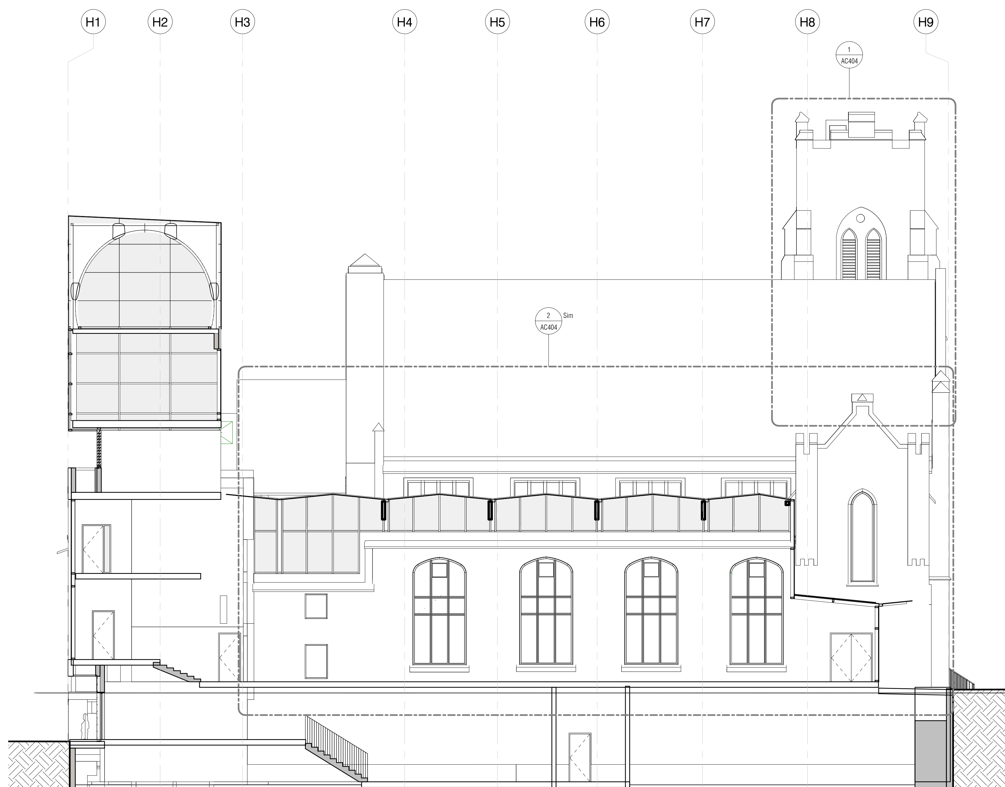
3 CHURCH WEST ELEVATION 1:100