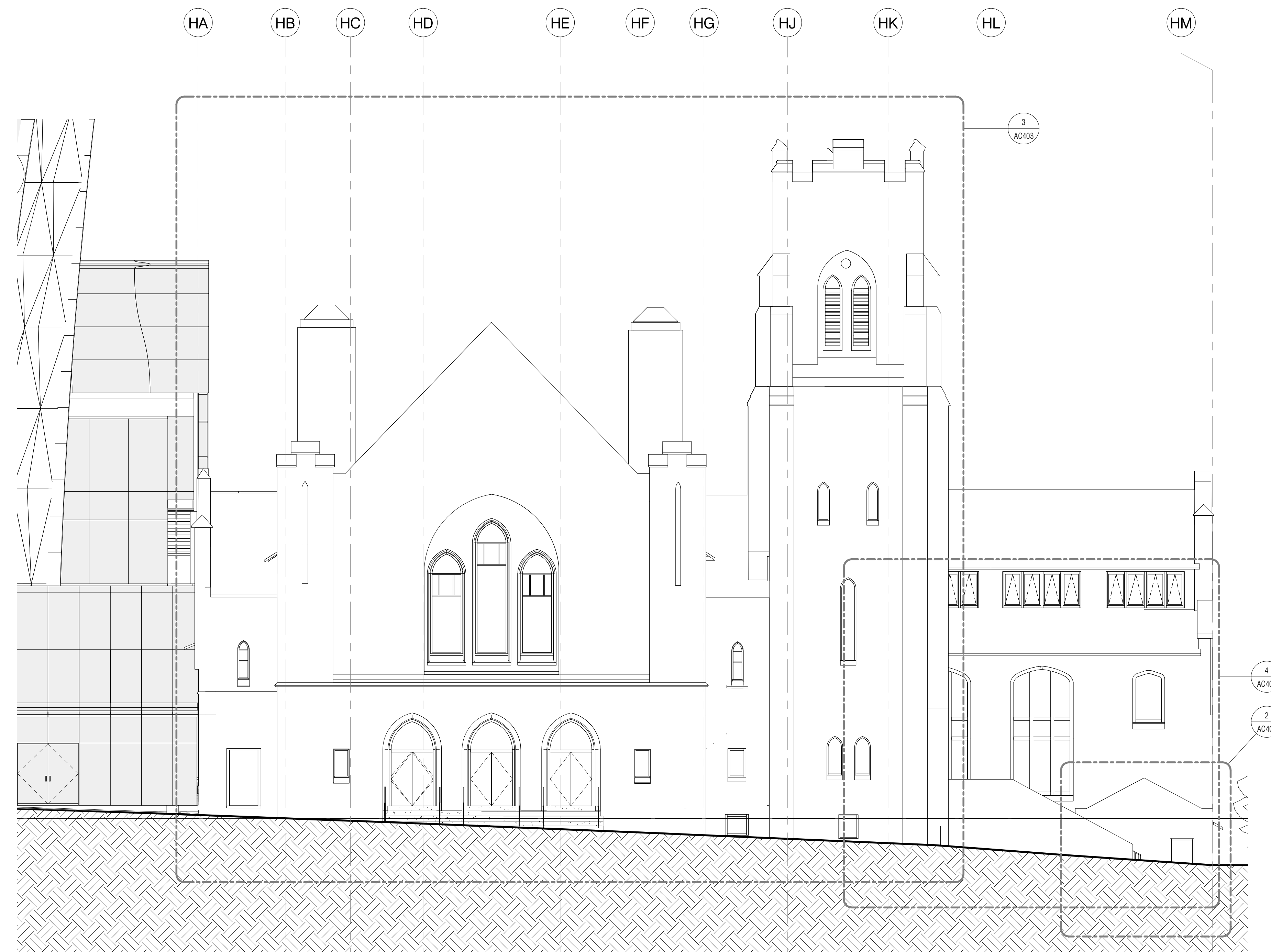
2 CHURCH SOUTH ELEVATION 1:100