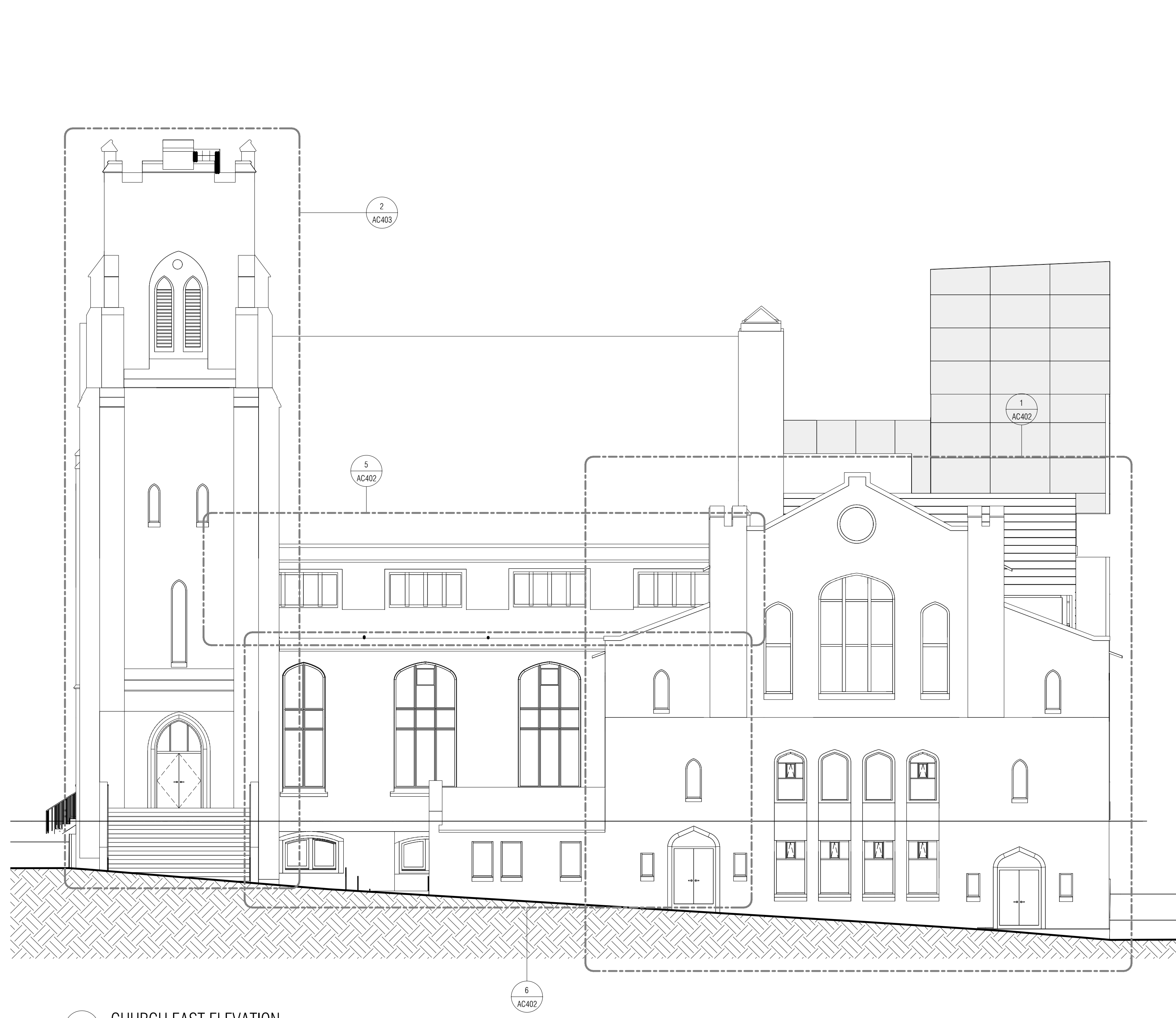
1 CHURCH EAST ELEVATION 1:100