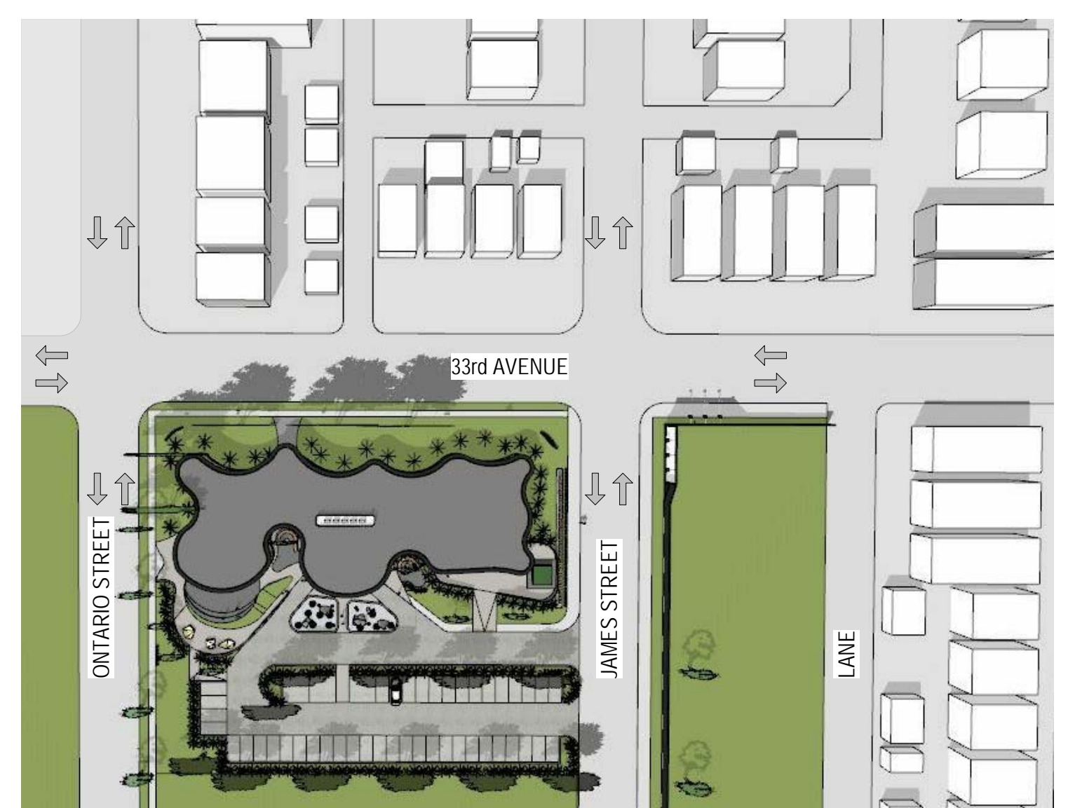
SHADOW ANALYSIS - SEPTEMBER 21st 12pm