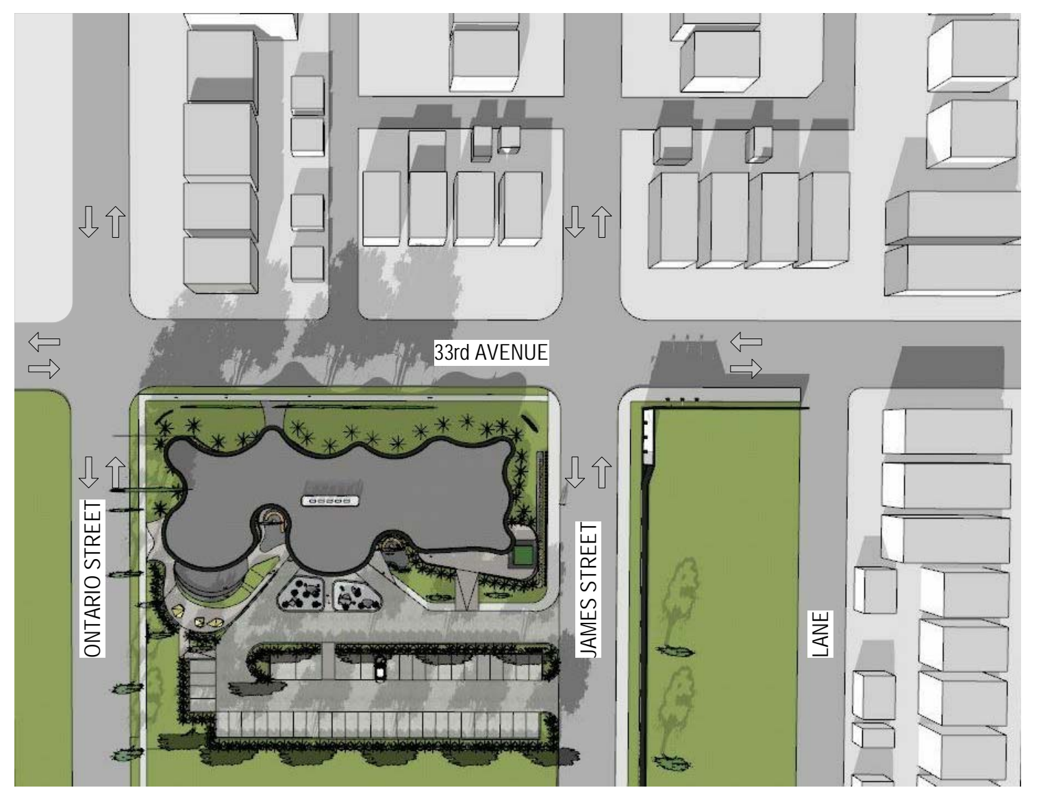
SHADOW ANALYSIS - DECEMBER 21st 12pm