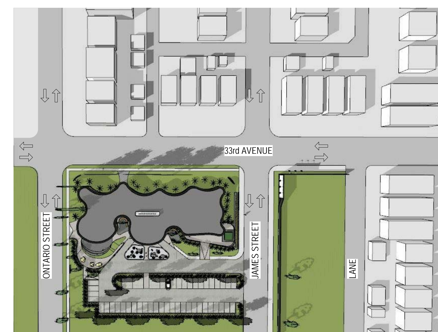
SHADOW ANALYSIS - SEPTEMBER 21st 2pm