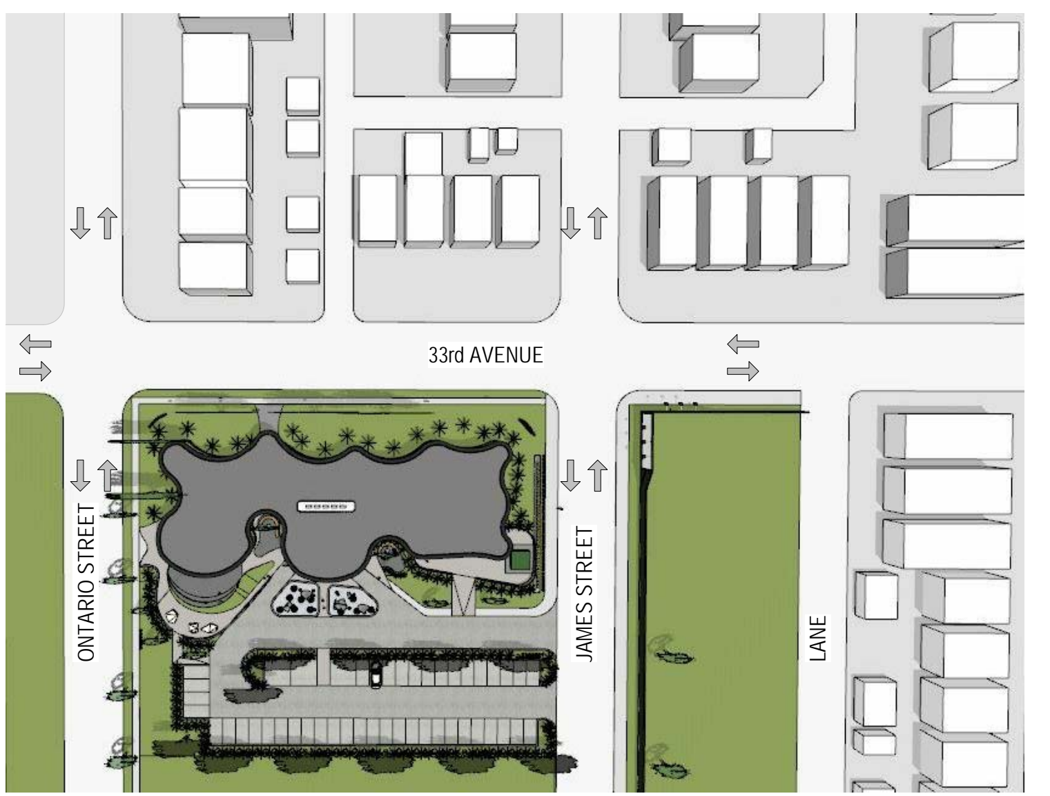
SHADOW ANALYSIS - JUNE 21st 10am