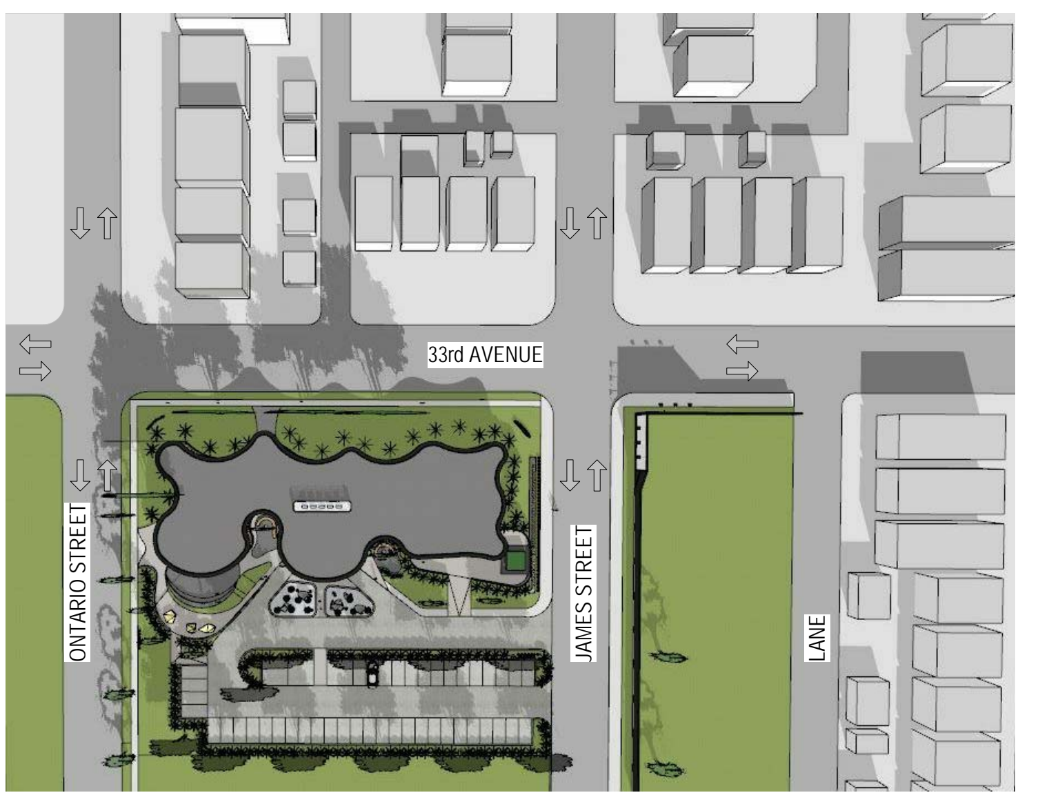
SHADOW ANALYSIS - DECEMBER 21st 10am