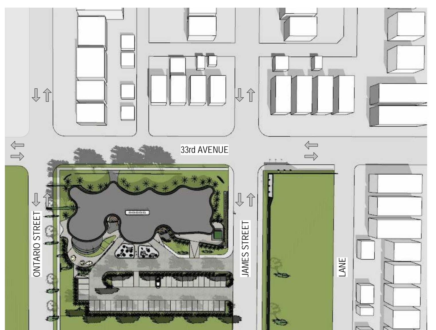
SHADOW ANALYSIS - SEPTEMBER 21st 10am