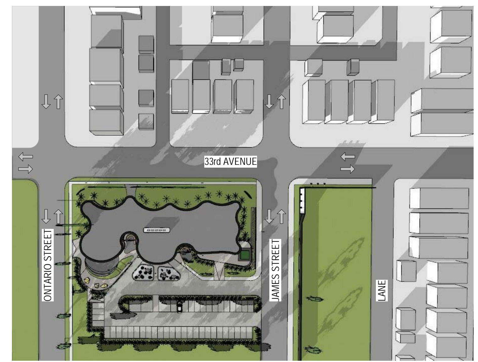
SHADOW ANALYSIS - DECEMBER 21st 2pm