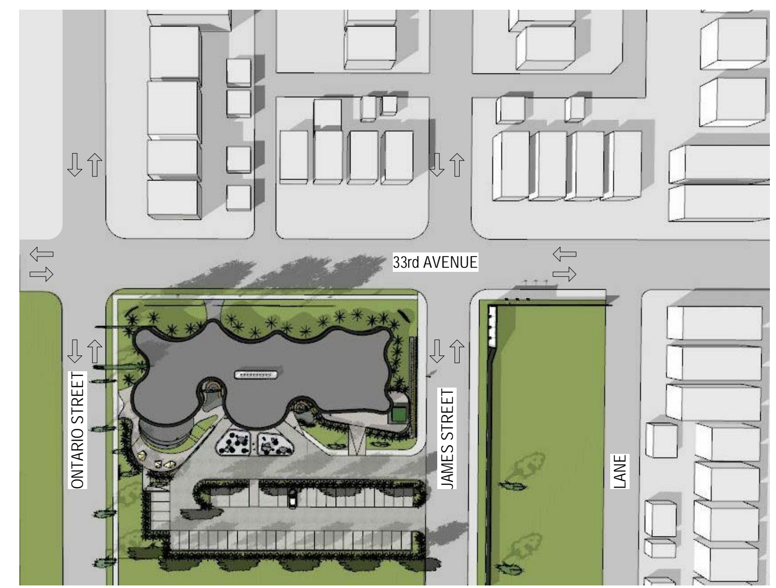
SHADOW ANALYSIS - JUNE 21st 2pm