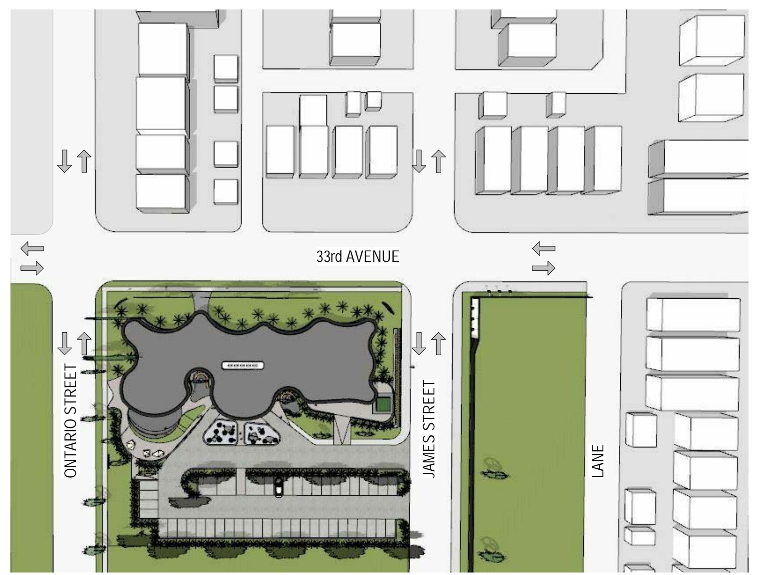
SHADOW ANALYSIS - JUNE 21st 12pm