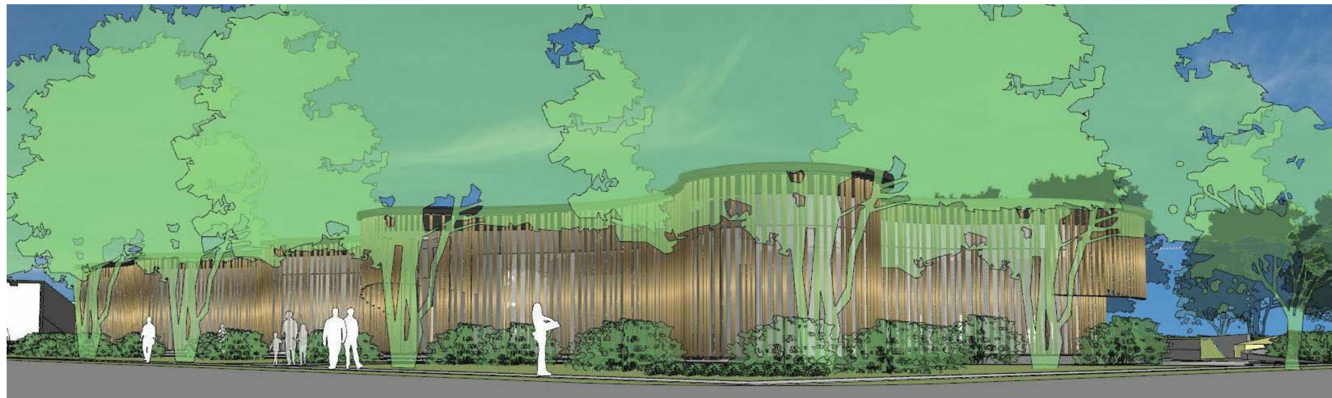
1 SE VIEW FROM ONTARIO ST. SCALE: NTS