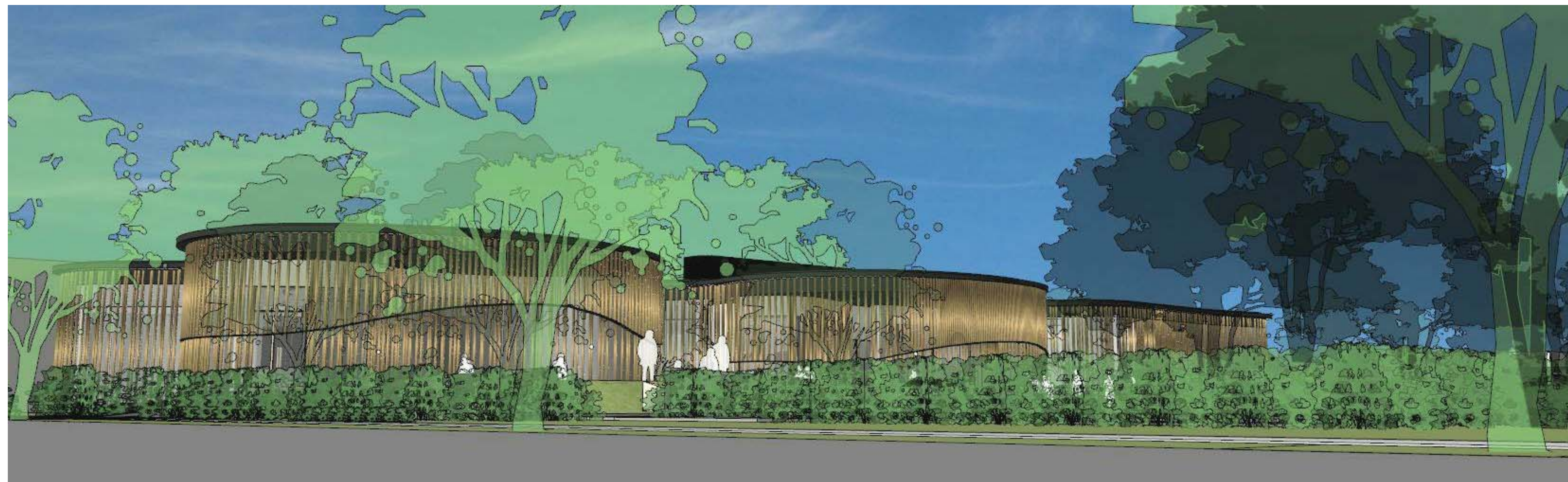
2 NE VIEW FROM ONTARIO ST. SCALE: NTS