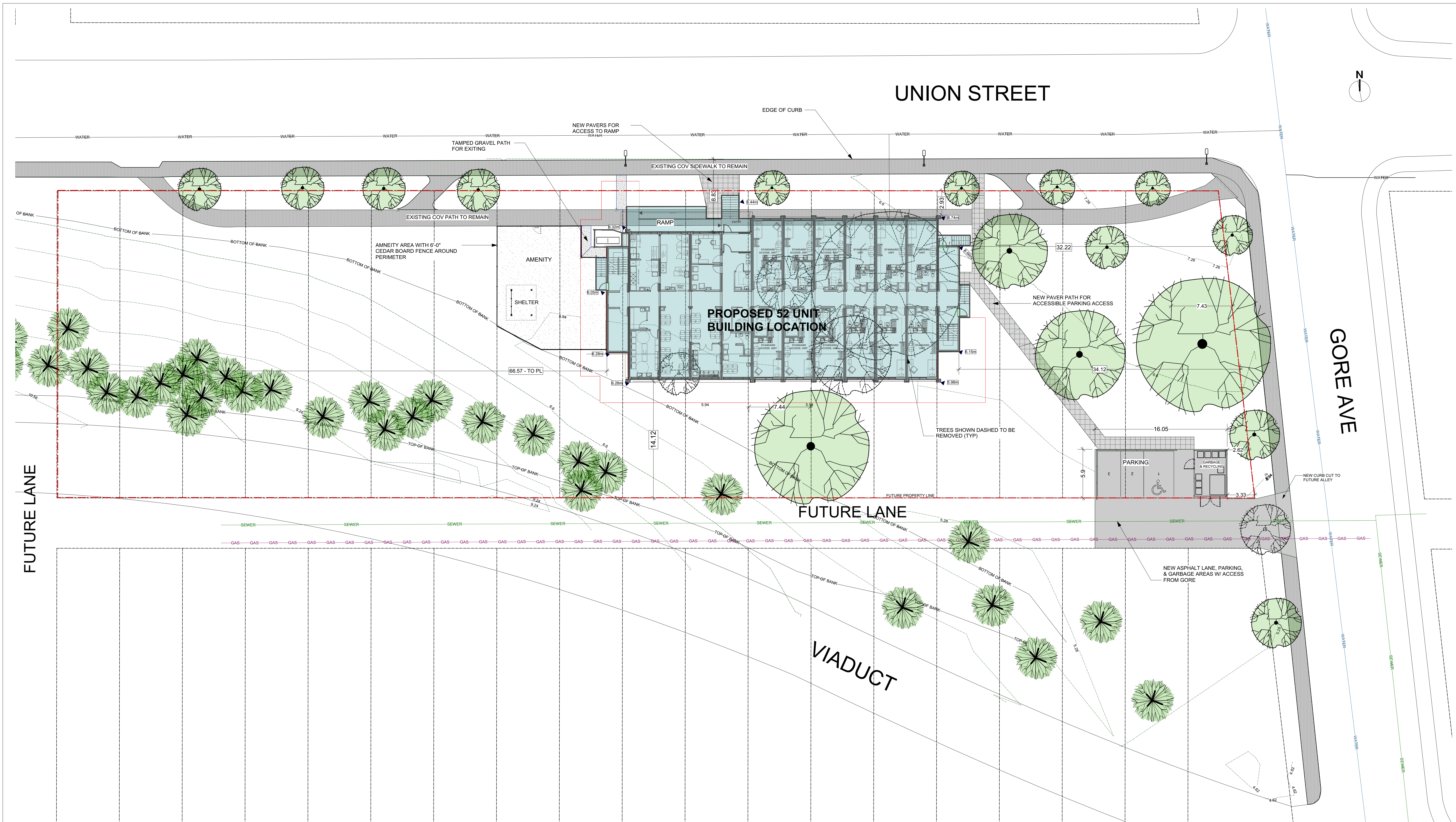
1 SITE PLAN Scale: 1:200

THESE DRAWINGS AND DESIGNS ARE THE SOLE PROPERTY OF HORIZON NORTH AND MAY NOT BE REPRODUCED OR SUBMITTED TO OUTSIDE PARTIES WITHOUT THE EXPRESSED WRITTEN CONSENT OF HORIZON NORTH