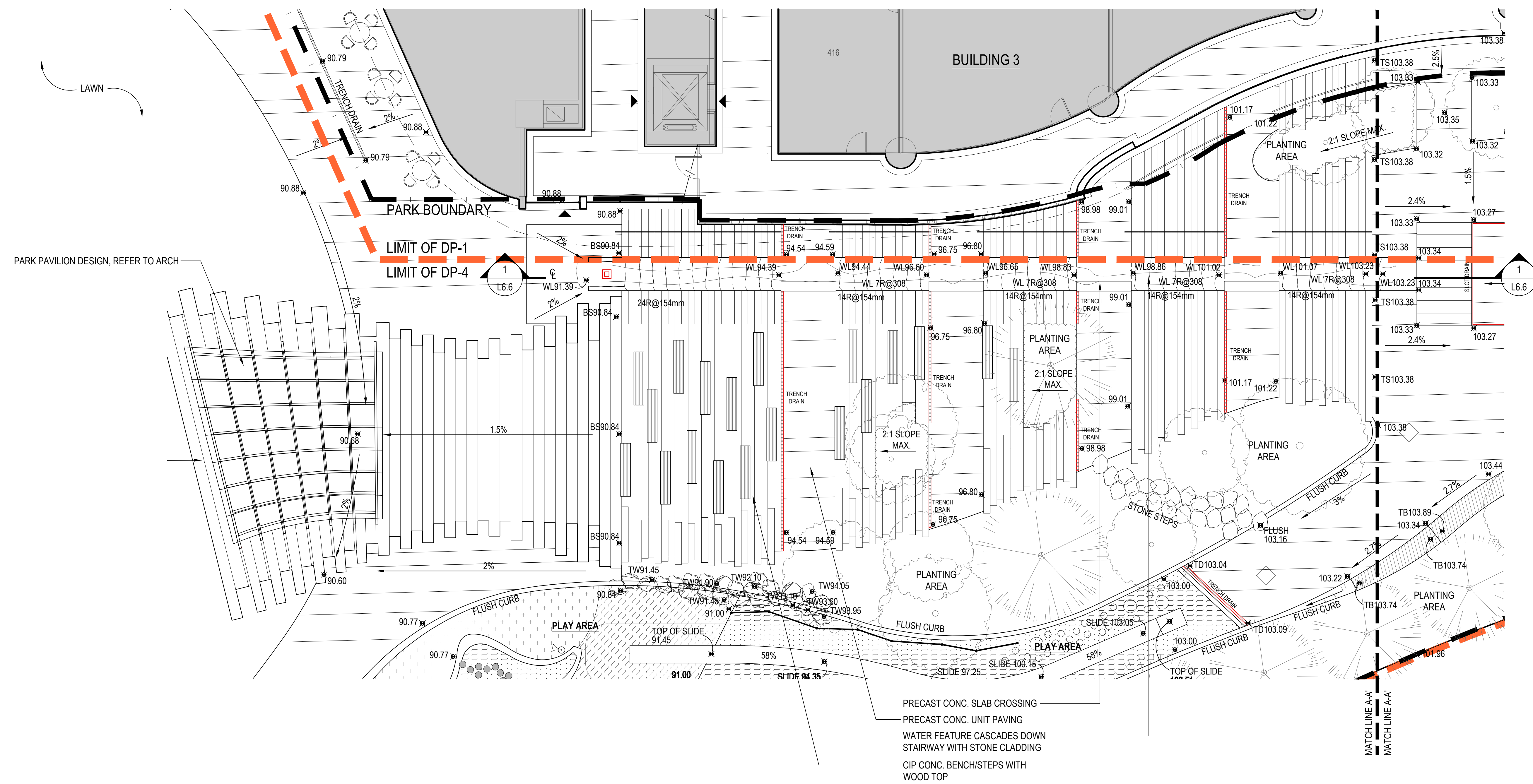
1 CIVIC CENTRE PARK - UPPPER PARK LEVEL (WEST) SCALE: 1:100