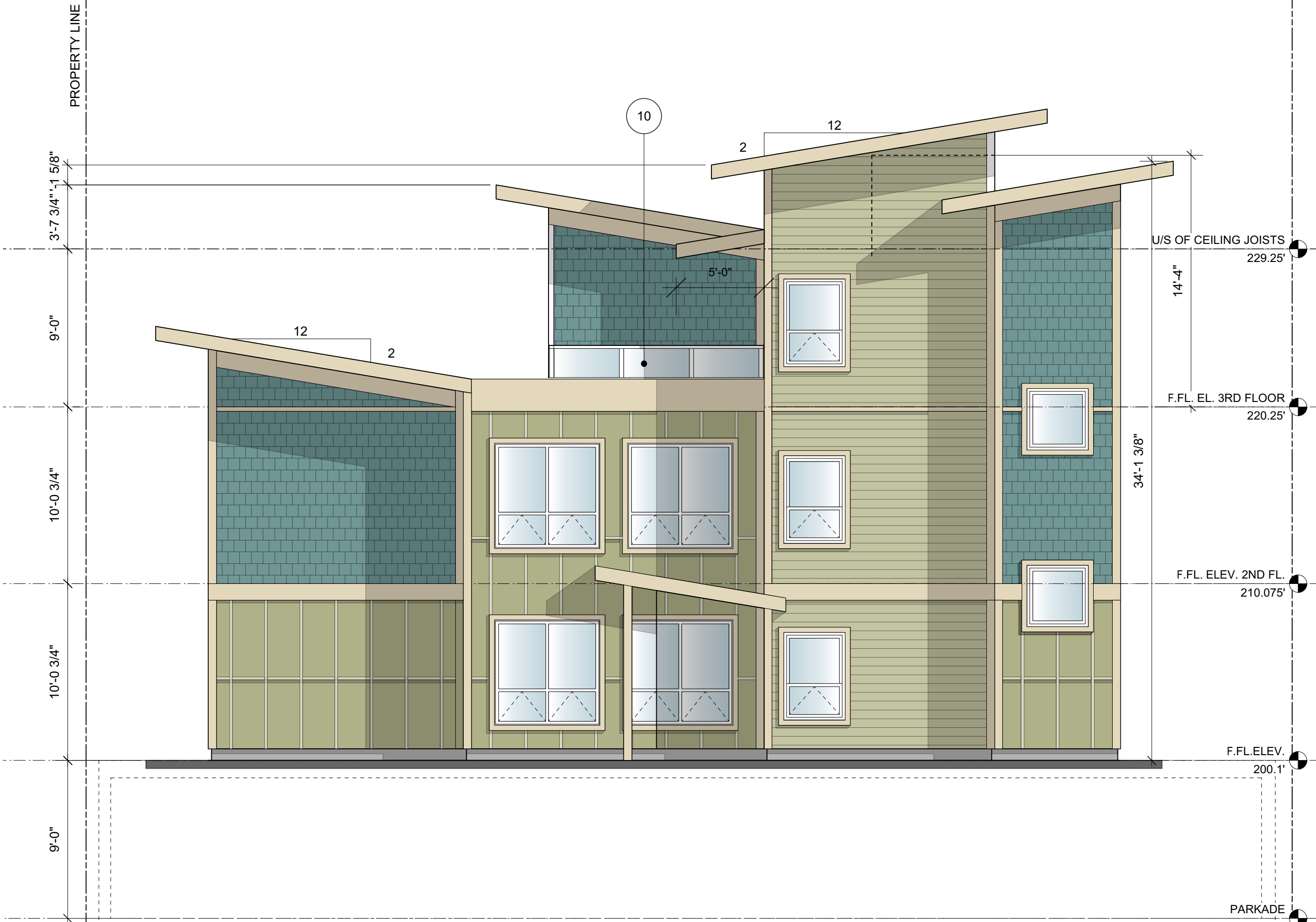
4 NORTH ELEVATION Scale: 3/16" = 1'-0"