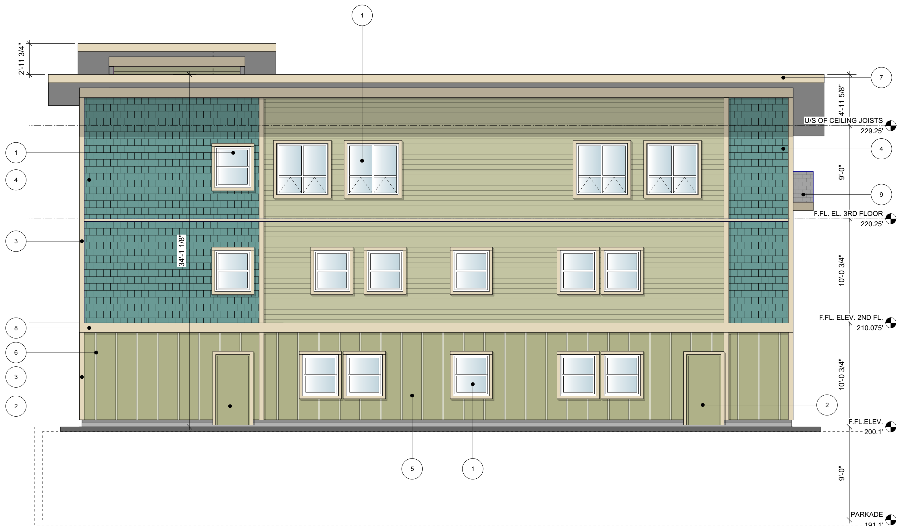
1 WEST ELEVATION Scale: 3/16" = 1'-0"