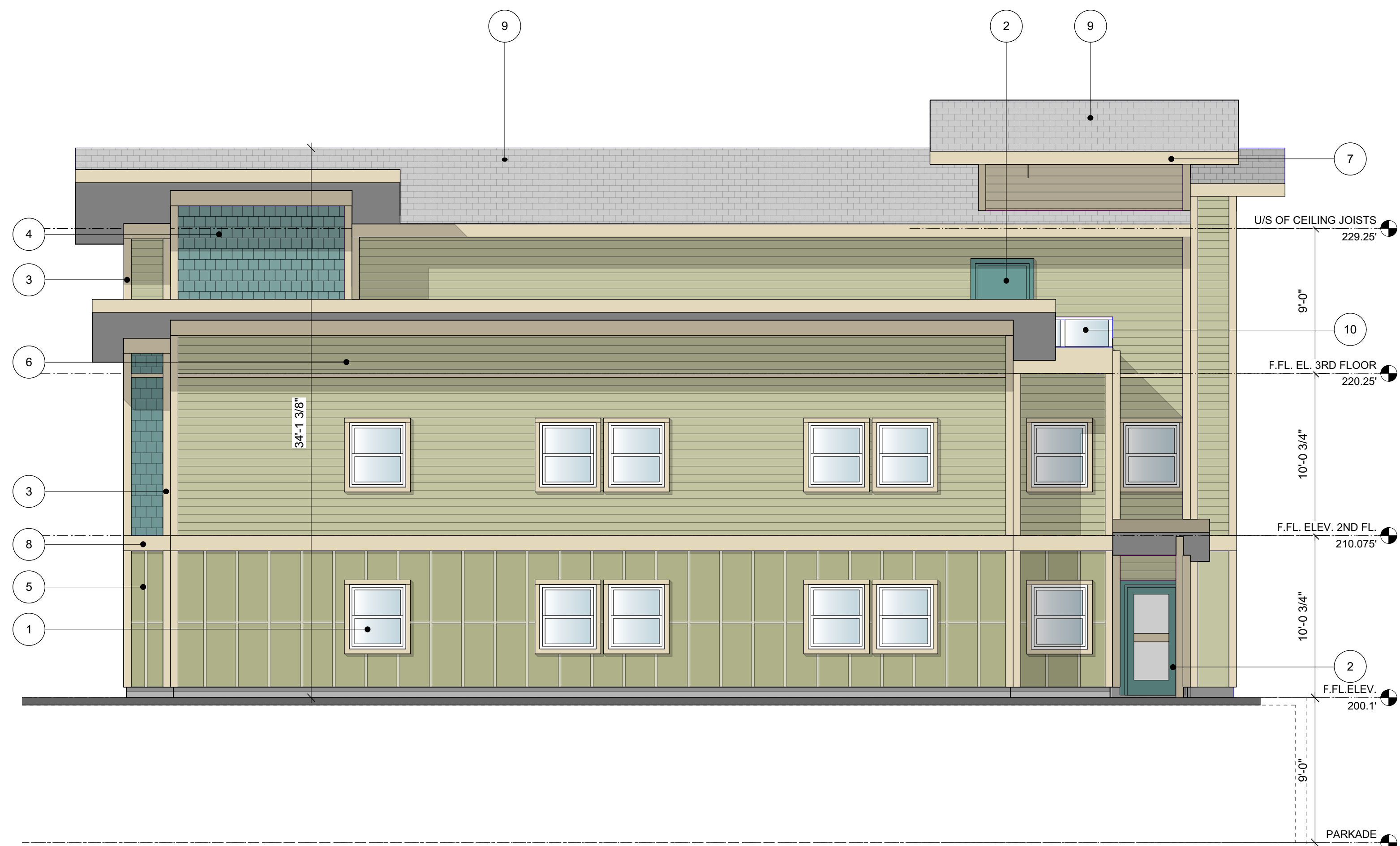
3 EAST ELEVATION Scale: 3/16" = 1'-0"