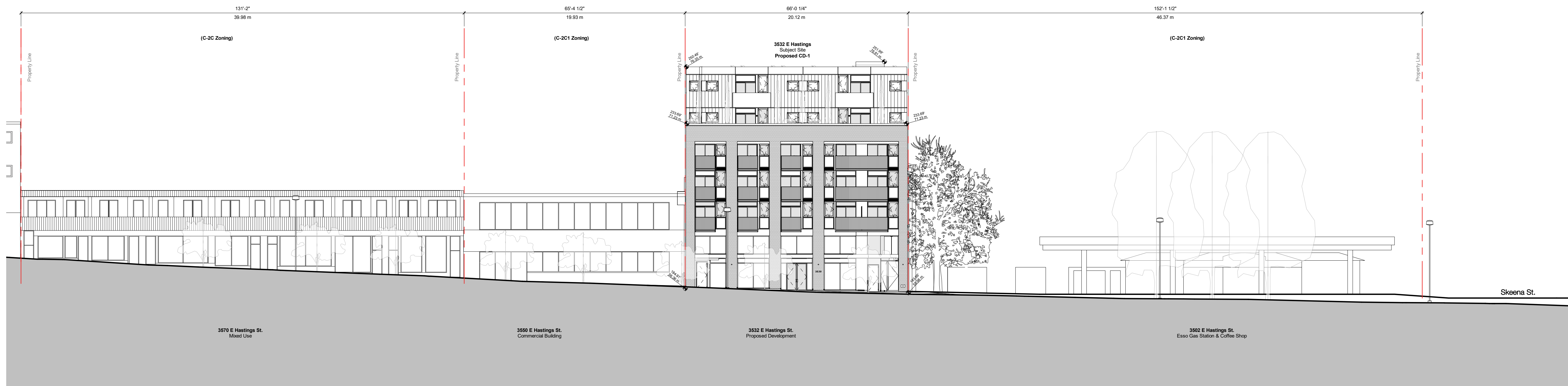
REF. 1 E Hastings Streetscape Elevation A101 SCALE: 1/16" = 1'-0"

COPYRIGHT: This drawing and all copyright herein are the sole and exclusive property of Gair Williamson Architects. Reproduction or use of this drawing in whole or in part, by any means, in any way whatsoever without the prior written consent of Gair Williamson Architects is strictly prohibited.