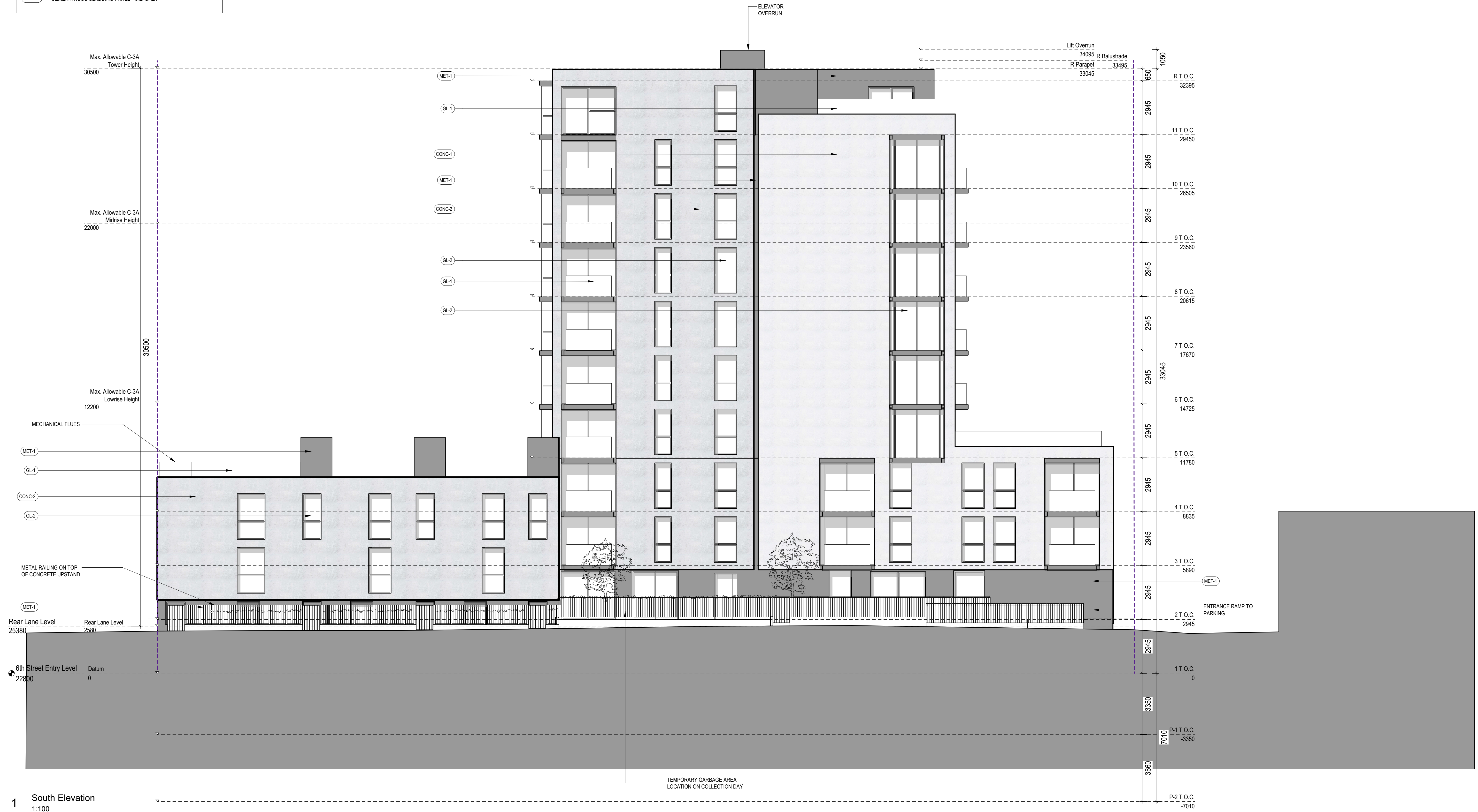
1 South Elevation 1:100