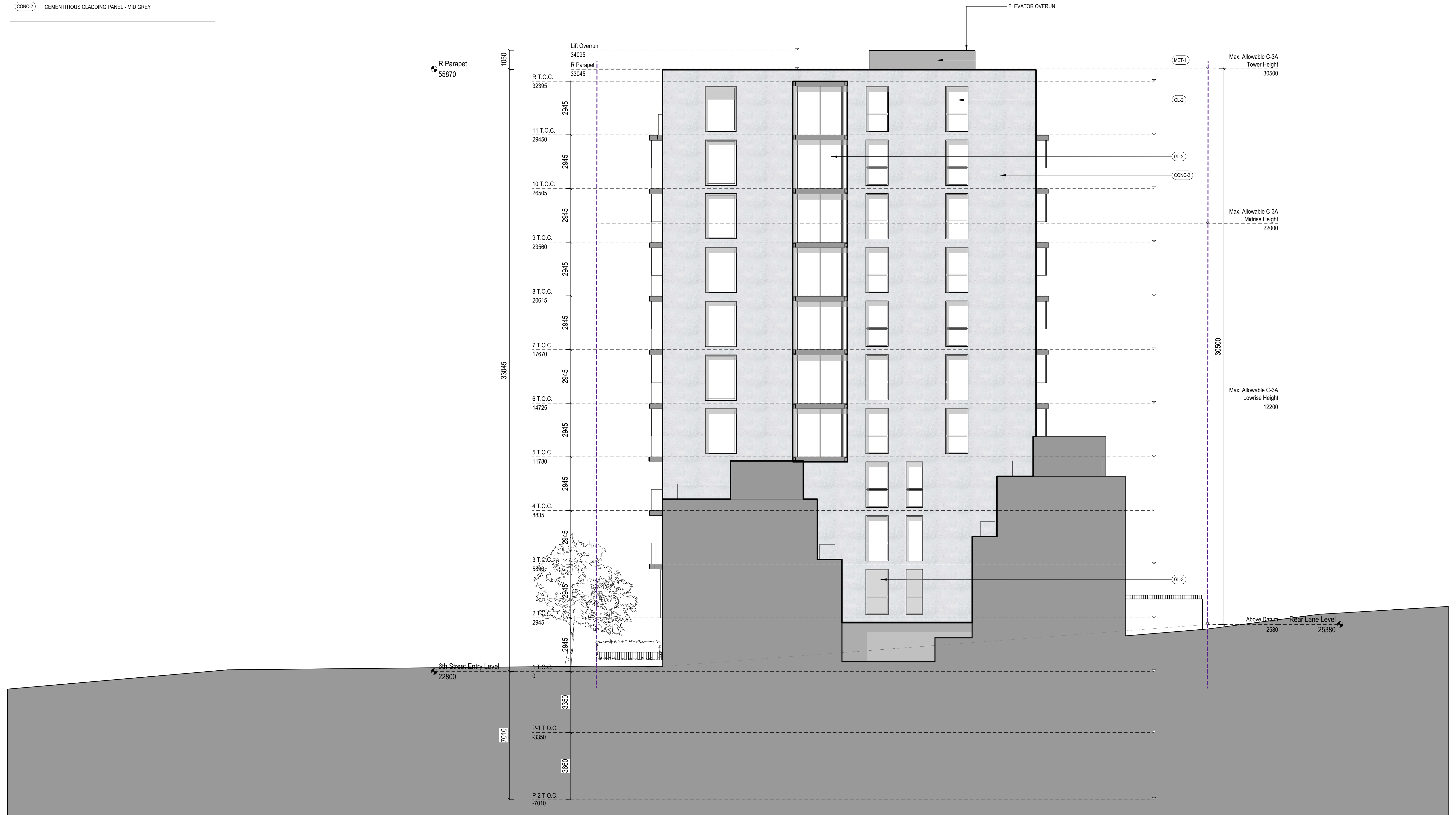
1 West Elevation 1:100