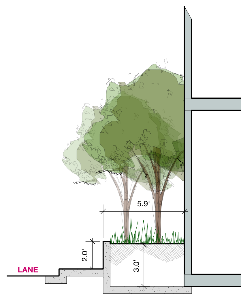
3 Section: Planter at Lane Scale: 1/4" = 1'-0"