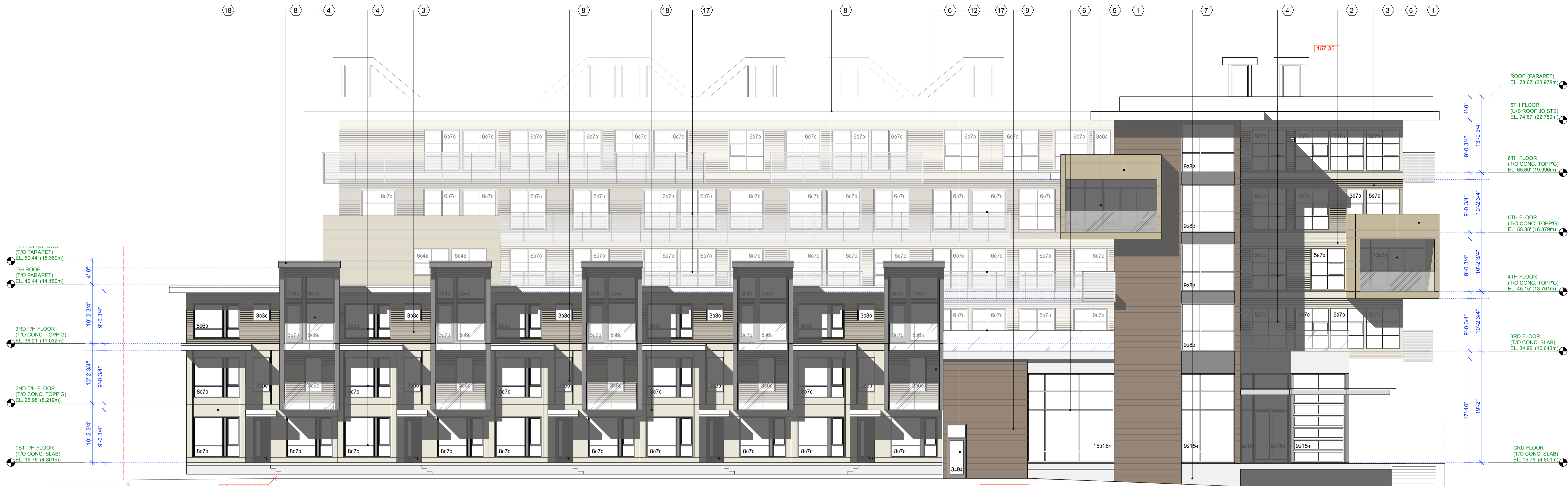
LOT 16.1 - SOUTH ELEVATION (GREENWAY) SCALE : 1/8" = 1'-0"