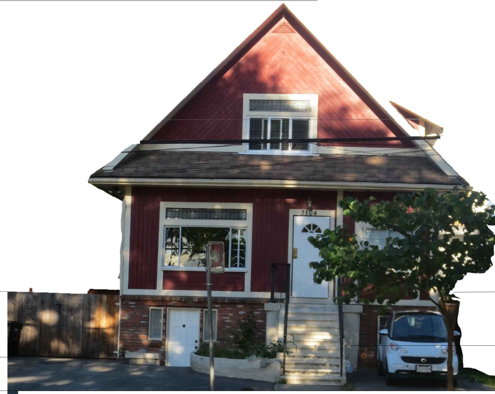
HOUSE NO. 3104