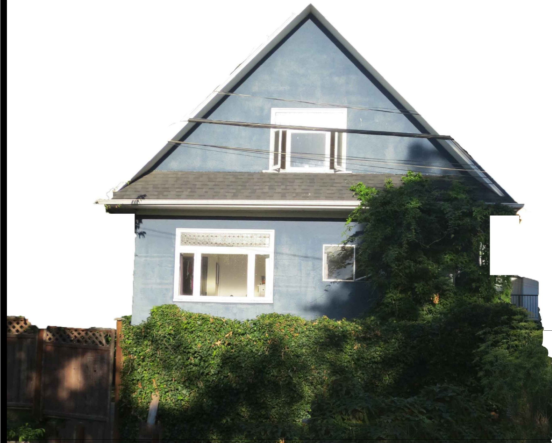
HOUSE NO. 3100