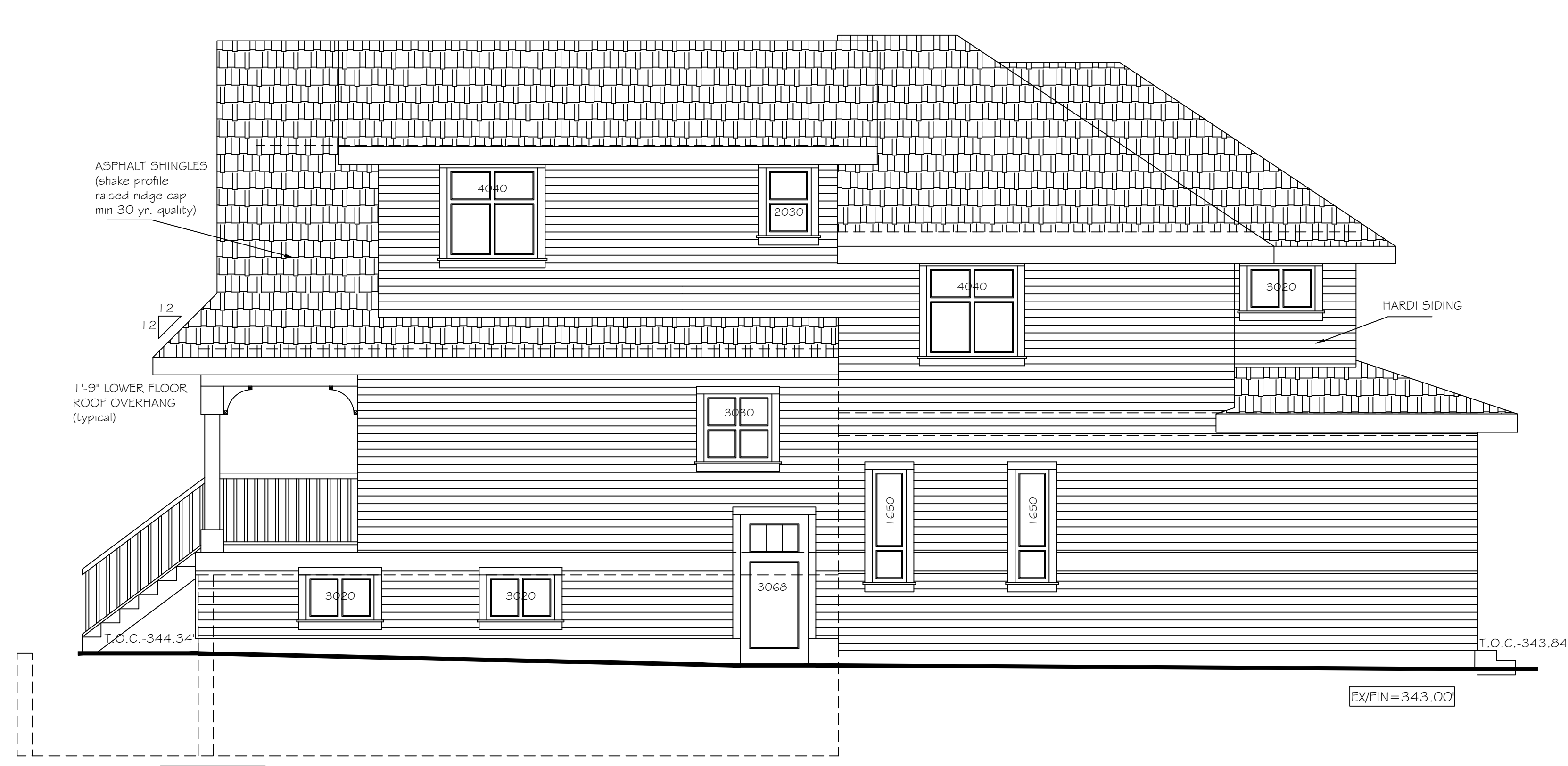
RIGHT (WEST) ELEVATION