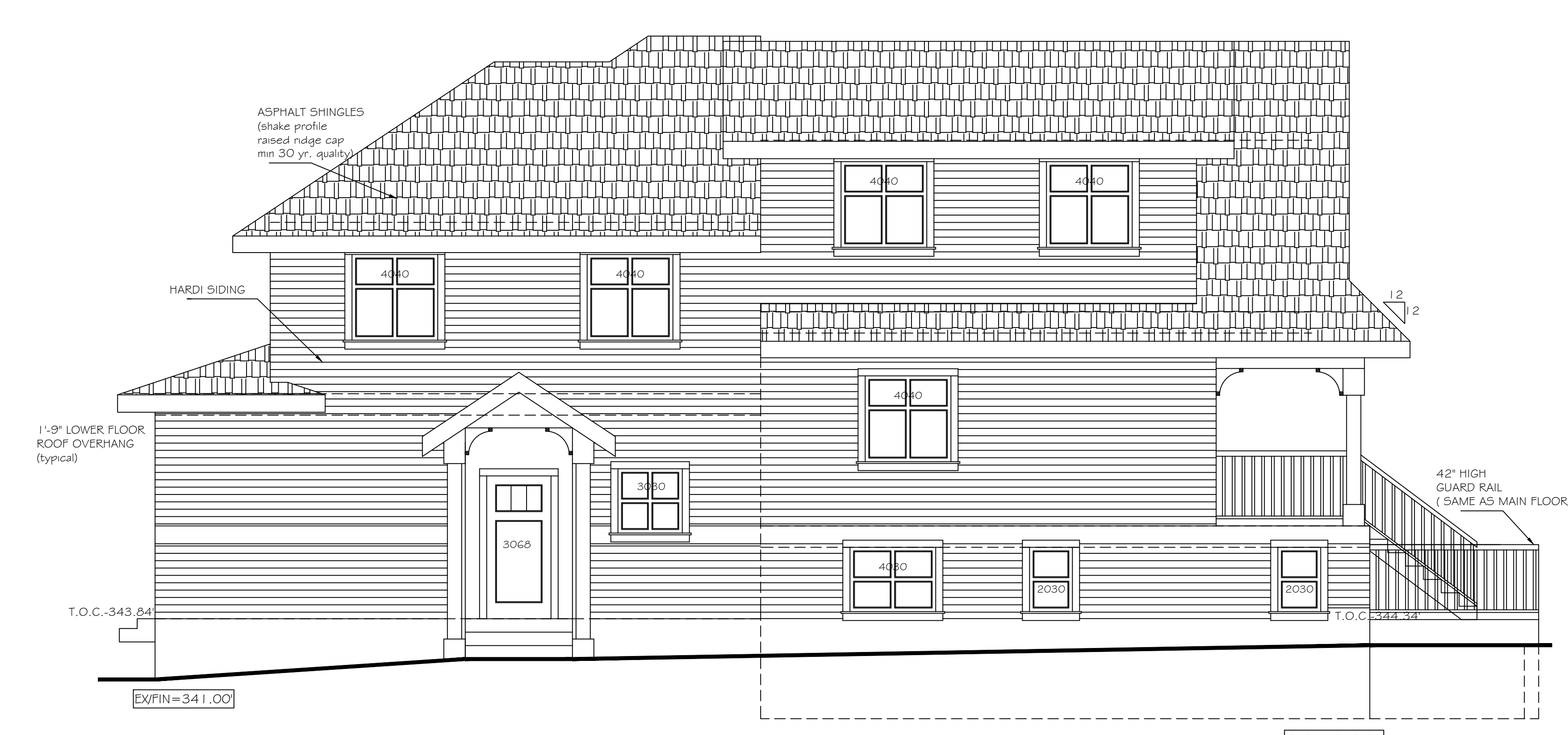
LEFT (EAST) ELEVATION